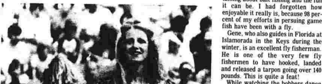
Fishing With Bait

ENDICOTT, N.Y. (UPI) — Tom Purtzer parlayed some past advice from fellow pros into a 5-under-par 66 Friday to match steady Tom Kite for the first-round lead in the rain-delayed $225,000 B.C. Open golf tournament.