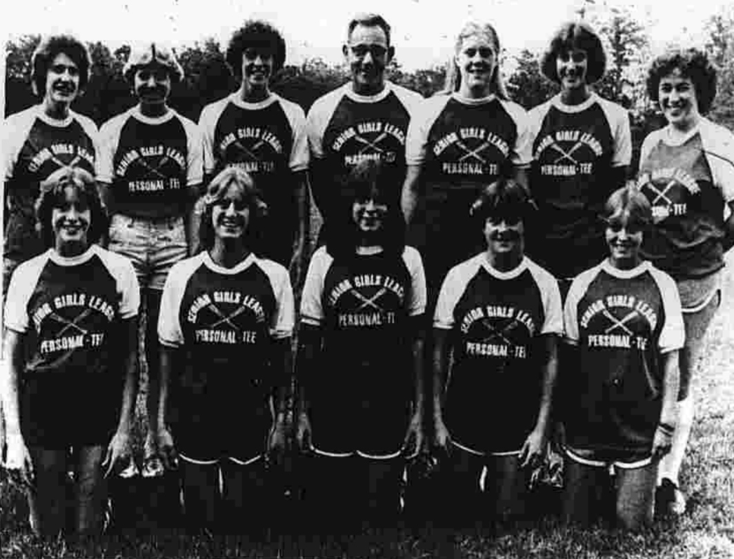
Senior Girls' Softball League Champions