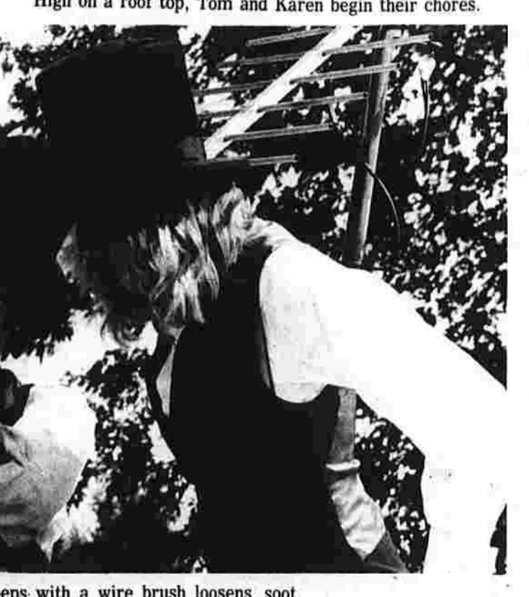
A few sweeps with a wire brush loosens soot.