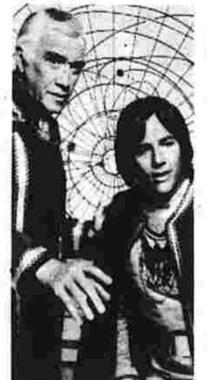
Lorne Greene, left, and Richard Hatch star in ABC's science-fiction-adventure "Battlestar Galactica" this fall.

7:00 Bowling For Dollars 7:30 Baseball Boston Red Sox vs. New York Yankees 8:00 Baseball New York Mets vs. Pittsburgh Pirates 10:40 Kiner's Korner 11:30 U.S. Open Tennis Highlights