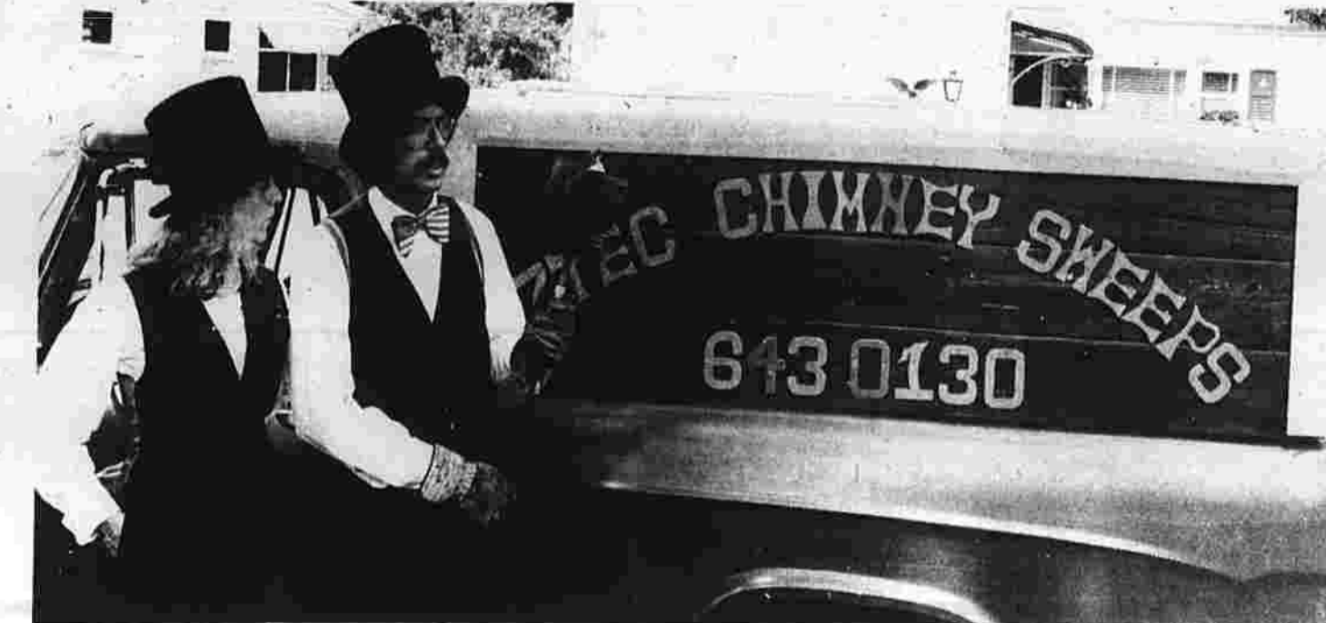
The "Aztec Chimney Sweeps" arrive at a home complete with top hat, bow ties and tuxedo pants and vest.